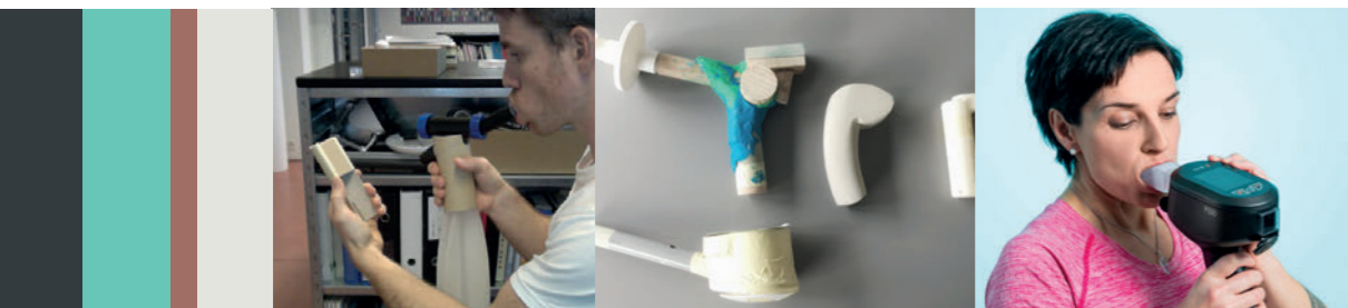
Early prototypes and implementation

Training programs motivate and interact with the users. The indices of the training groups are shared and documented.