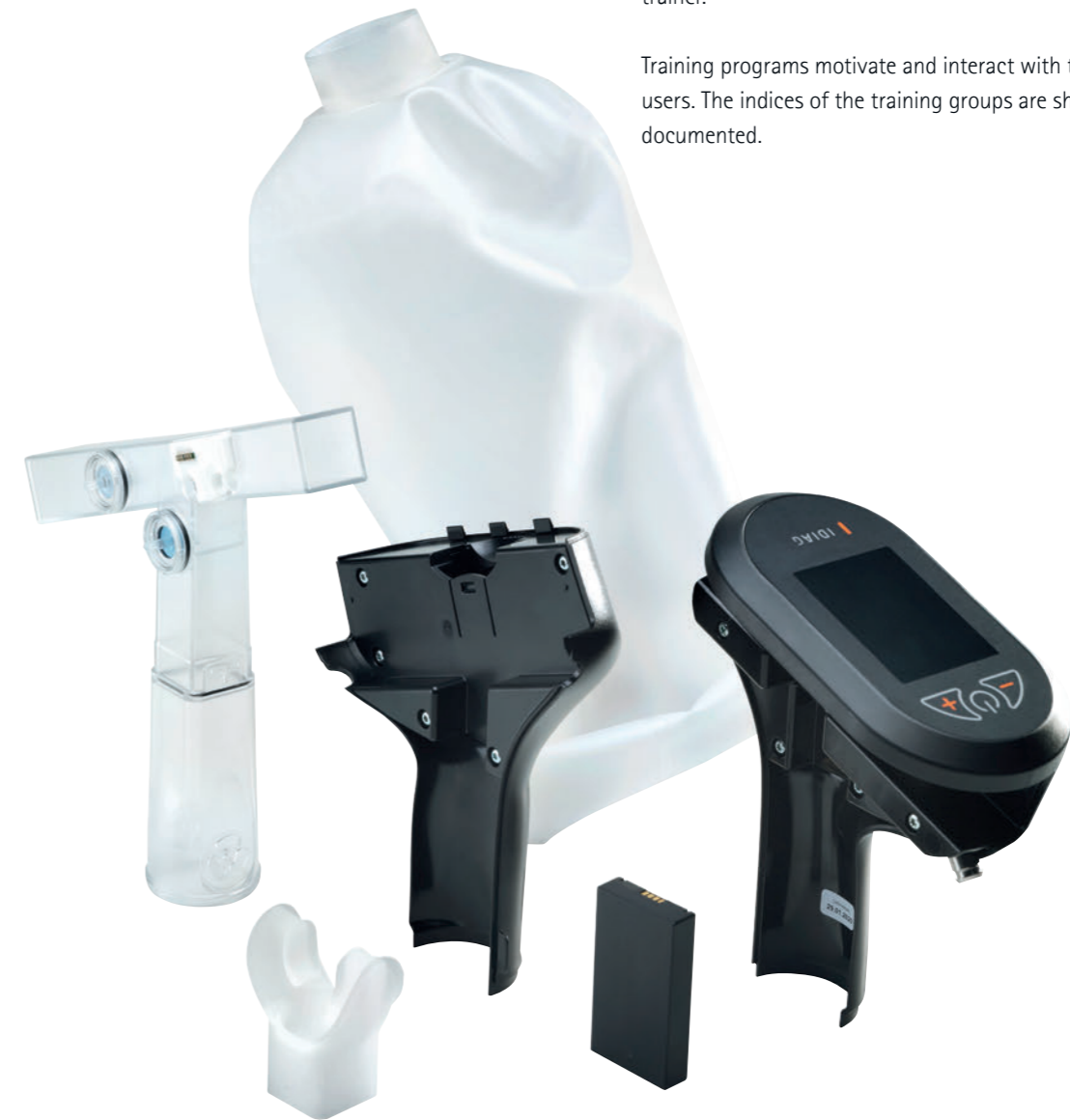
The P100 respiratory training device from IDIAG and its components.