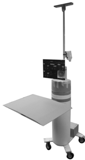
Early model and prototype: The dry labs were conducted in a cardboard model.

The result is a user-friendly, technically highly innovative product. The brand SOPHI is self-explanatory and, at the same time, conveys an emotional quality which is welcomed by everyone.