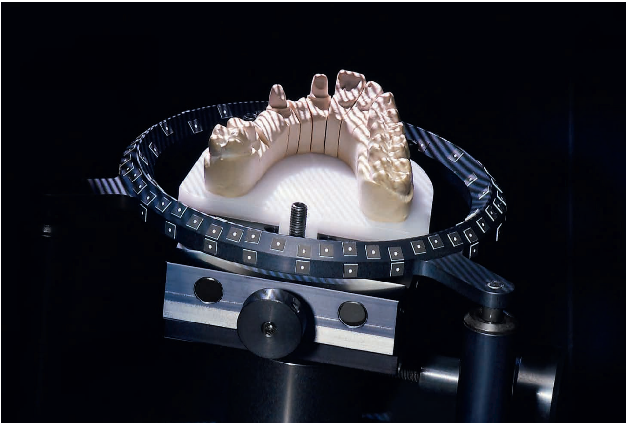
The structured-light 3D scanner technology from Imetric

Thanks to efficient cooperation via the production platform «Expertgroup™», launched by Erdmann Design with integrated services design/engineering/manufacturing, this product was ready for production within a matter of months. In a market in which there is considerable pressure to innovate, excellent timing provided a decisive market advantage at the International Dental Show IDS in Cologne.