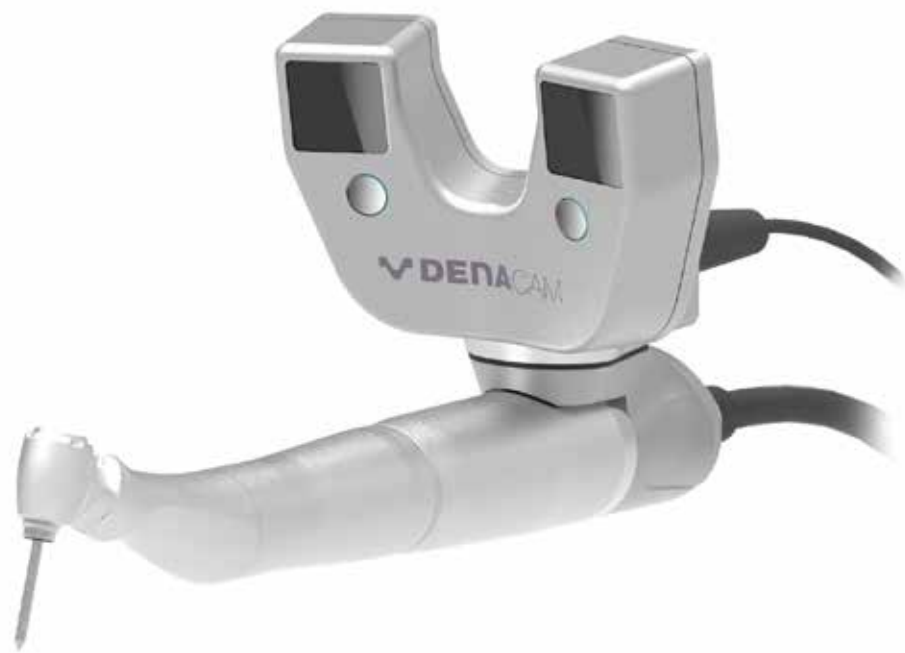
The DENACAM navigation device, attached to the surgical drill